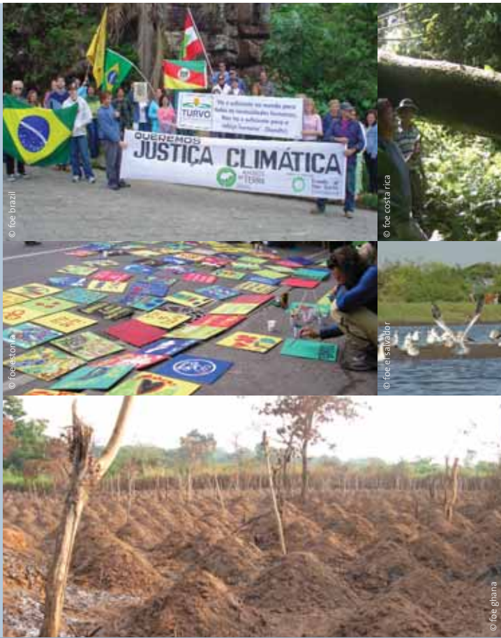
Clockwise from top left: In October, Friends of the Earth Brazil and local groups organized a demonstration calling for climate justice in the town of Araranguá, where the eye of Hurricane Catarina hit in 2004. They also presented a manifesto on climate justice at the Climate Convention meeting in Montreal in November; Sustainable forestry in Costa Rica's Osa peninsula; Costa Rica's Osa peninsula; Middle photo: Wetlands in El Salvador protected under RAMSAR Convention; Yam farm in Ghana exposed to soil erosion; Car-free day in Estonia.