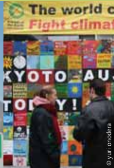
Top left: Friends of the Earth and community members protest at the 2005 Shell AGM. Top right: Friends of the Earth's climate mosaic at the December UN Climate Negotiations in Montreal. Bottom left: Campaigners delivering petition against GM food to WTO chief Pascal Lamy at the December Ministerial meeting in Hong Kong.