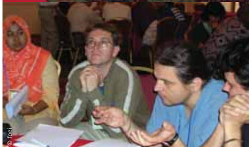
Top photo: African groups celebrate their strategic visioning. Lower photo: Creating a common vision in Penang.