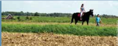
Left photo: Green space in the Netherlands saved from development. Middle photo: Israeli and Palestinian residents visit the site of the planned separation wall. Right photo: Collecting signatures for an environmentally-friendly chemicals policy in Hungary.

Since 2001, Friends of the Earth Middle East has run a Good Water Neighbors project with communities in Israel and Palestine. Over the years, the Wadi Fukin (Palestine), and Tsur Hadassah (Israel) communities have built trust through community site visits, building water saving models in their schools, carrying out landscape and hydrological surveys, and writing letters to decision-makers to help preserve their unique cultural landscape. Furthermore, the