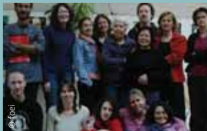
Friends of the Earth International Secretariat.