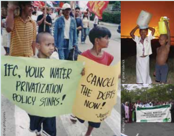
Children in the Niger Delta.