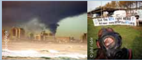
Pollution in Durban, South Africa.

Throughout the year, three Slovak towns rejected plans for hazardous waste incinerators to be co-financed from the European Union's Cohesion Fund. These incinerators were designed to process large amounts of waste imported from other regions and very likely from abroad. In all cases, Friends of the Earth Slovakia provided expert studies to the municipalities, helping to generate the public and official rejection of the projects. The group also succeeded in promoting cleaner alternatives to incineration, and helped 117 municipalities to decrease municipal waste and increase recycling. One town, Palarikovo, has reduced waste levels by 73 percent since 2000, a record in Central and Eastern Europe.