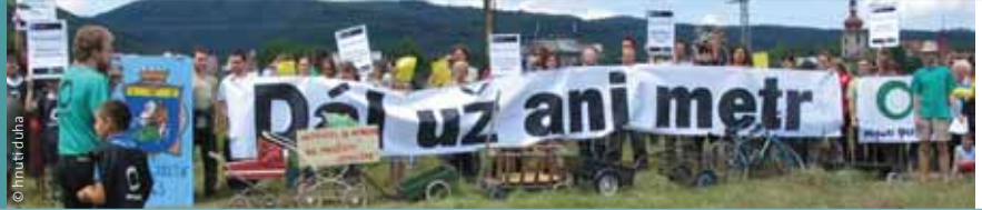
Demonstrating against lignite mining in the Czech Republic.