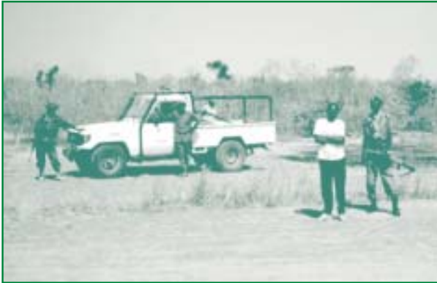
Martin Zin ©