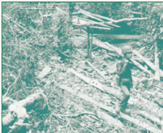
EarthRights International ®

Federal judge Ronald S. Lew found that the plaintiffs suing Unocal had evidence that "Unocal knew that the military had a record of committing human rights abuses; that the [Yadana] Project hired the military to provide security for the Project, a military that forced villagers to work and entire villages to relocate for the benefit of the Project; that the military, while forcing villagers to work and relocate, committed numerous acts of violence; and that Unocal knew or should have known that the military did commit, was committing and would continue to commit" human rights abuses. A US Federal Appeals Court agreed with this description, characterizing the forced labor as "a modern variant of slavery."