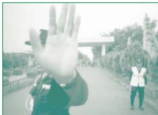
Security guard at NIKE subcontractor in Indonesia