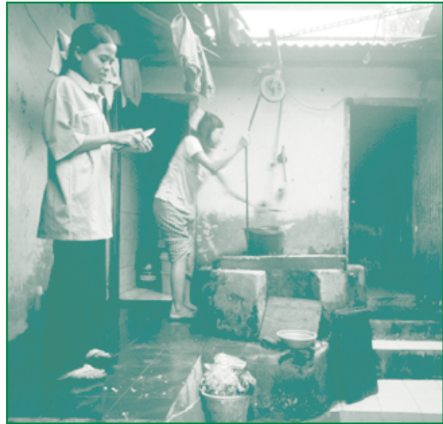
Ashley Gilbertson, OxfamCAA

Restrictions on organizing are not the only labor rights violations that workers at Nike factories face. Unless properly managed, the processes involved in sport shoe production can pose very serious risks to workers' health and safety. Potential problems include exposure to dangerous chem-