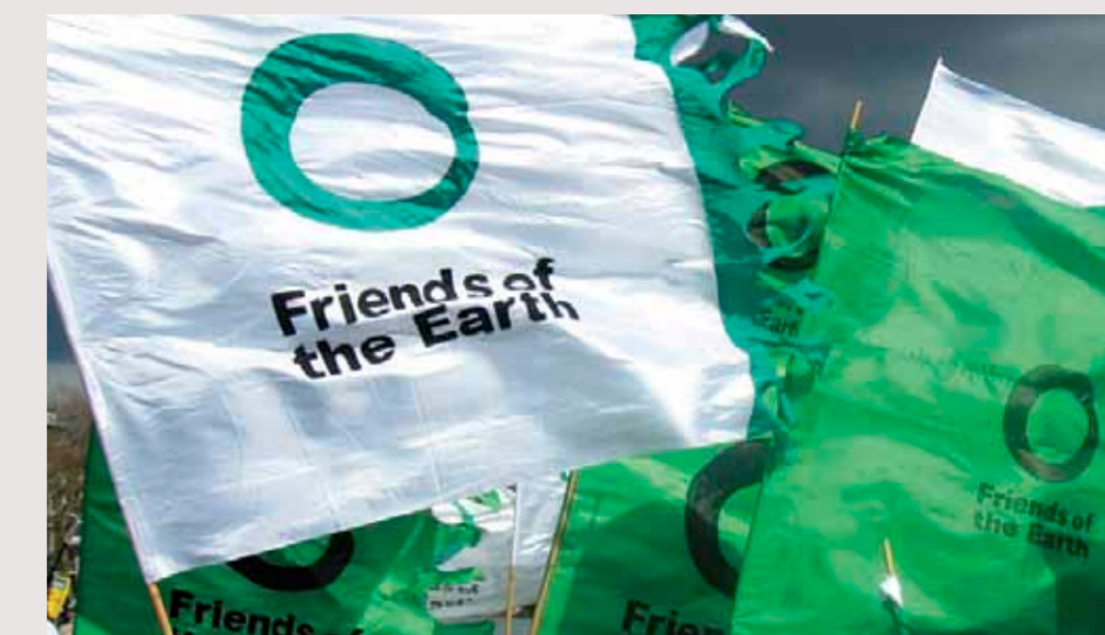
Friends of the Earth

Changing our individual behaviour can help, but we'll have even more impact if we act together to change politics. That's why Friends of the Earth asks you to support us in our work. Here's how you can help: