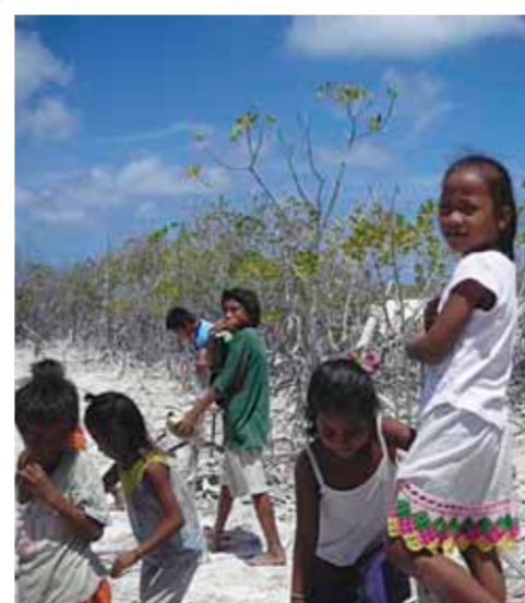
Pacific Calling Partnership/Edmund Rice Centre

www.foe.co.uk/environmentaljustice/evidence