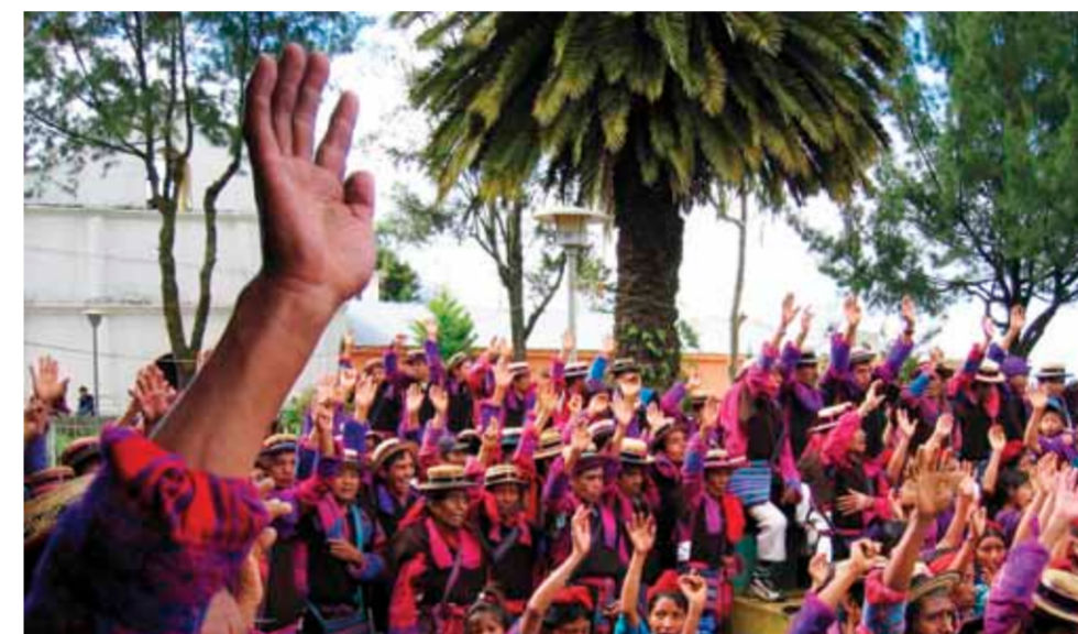
CEIBA/Friends of the Earth, Guatemala

In this booklet we highlight examples of environmental injustice – and describe what we're doing to tackle them. Read on and find out how we can work together for a fairer – and greener – future.