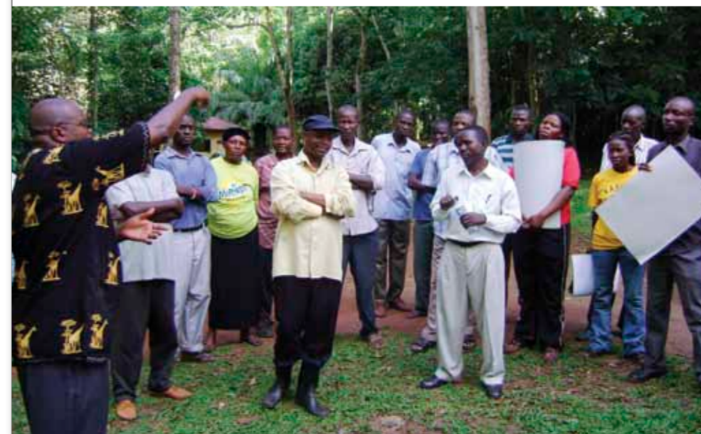
NAPE/Friends of the Earth Uganda

Professional Environmentalists (NAPE). The Government had planned to sell the forest to a company to use it for growing sugar cane. NAPE stepped in and, with local people, spearheaded a coalition to save it. A campaign that included mass texting, online letters and demonstrations brought the issue to national attention. The Government has now backed down.