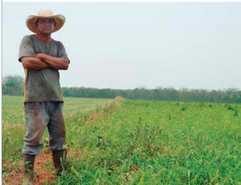
Friends of the Earth

Small farmers are selling up because they cannot compete with the big businesses running the plantations; some are driven from their land at gunpoint. There is also evidence that pesticides used to spray the soy are poisoning locals. Friends of the Earth Paraguay/Sobrevivencia is working to publicise the problems of soy, promote the need for alternative crops, and push for laws that protect rural villages.