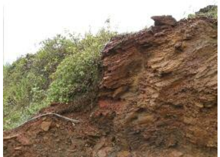
Iron ore, rock Tokadeh Mine, Nimba County