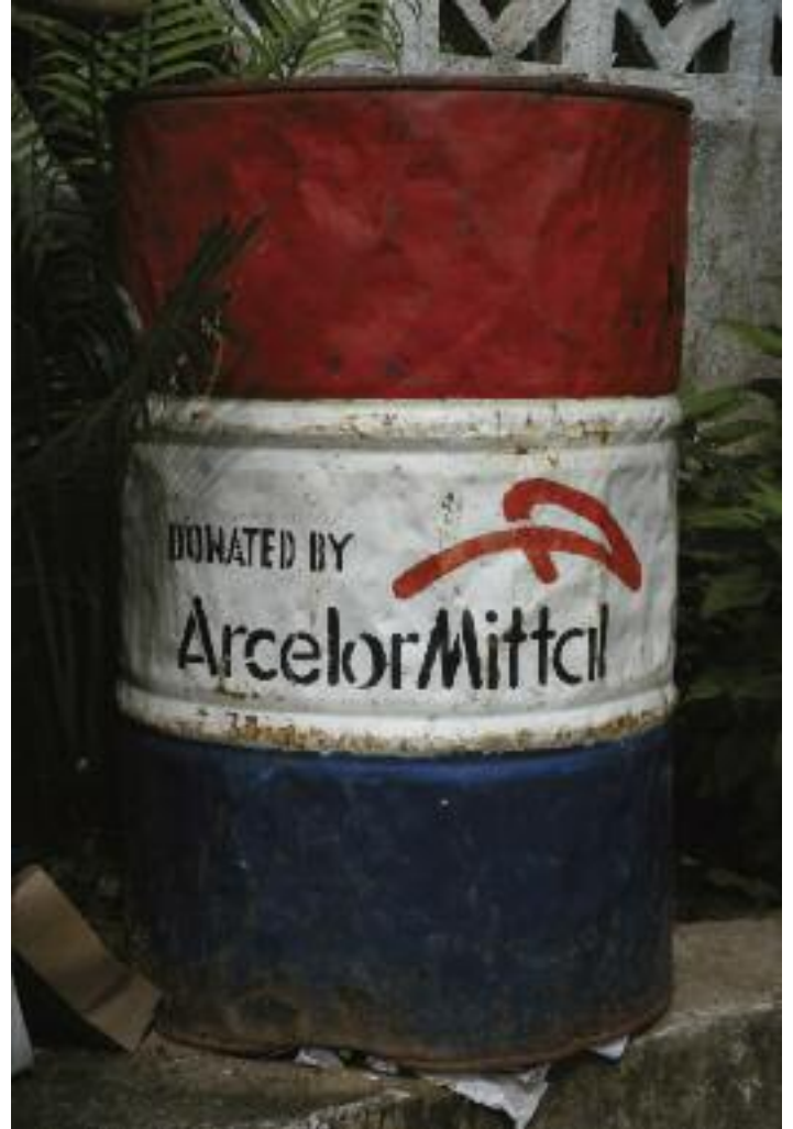
Donated by ArcelorMittal.

The issues arising from this review go to the heart of the ethical debates about whether it is better for the corporations to make voluntary social contributions or to pay taxes that are negotiated in a fair and transparent manner, during contract negotiations. For example, in the previous contract with the interim government of Liberia, ArcelorMittal enjoyed a tax holiday and was given control of major state assets. Ironically, it was in that contract that the idea of the Social Development Fund, which became a key selling point of the contract, was introduced. This contract was made void by the newly elected government, after international pressure, as the contract heavily favoured ArcelorMittal (This was prior to the merger with Arcelor).