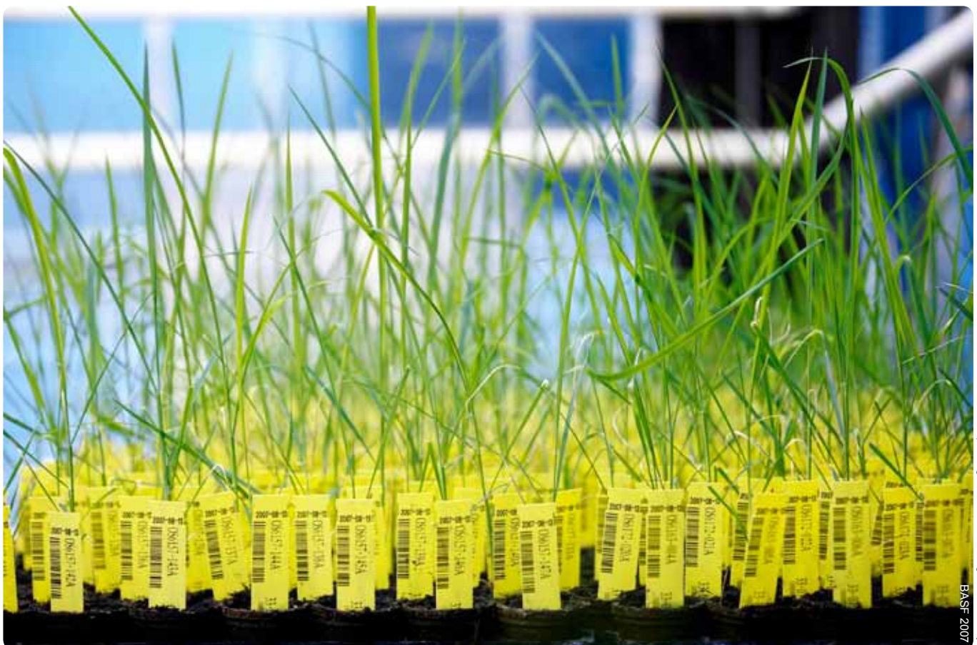
Crop Design - The fine art of gene discovery BASF 2007

The UK Government provides a striking example of this technological approach, but it is not the only one. The Gates Foundation is also focussed on technological solutions for agriculture, and is particularly supportive of biotechnology. A recent analysis of its grants database found that between 2005 and 2011 the Gates Foundation spent US$162 million on projects that included genetic modification (GM) technologies, such as drought tolerant maize, maize with improved nitrogen efficiency, crops with increased levels