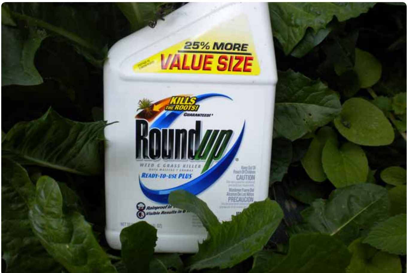
Container of Monsanto's Roundup Pesticide

Global GM crop production is dominated by herbicide tolerance, whether in maize, soybean, cotton or oilseed rape. The main herbicide used is glyphosate, which was developed and often marketed by Monsanto as Roundup, although it is also marketed under other names. Glyphosate is a broad-