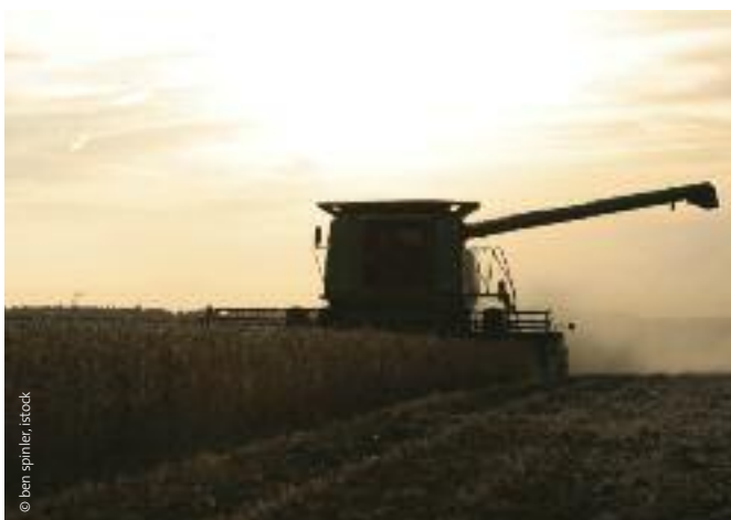
Harvesting of soy