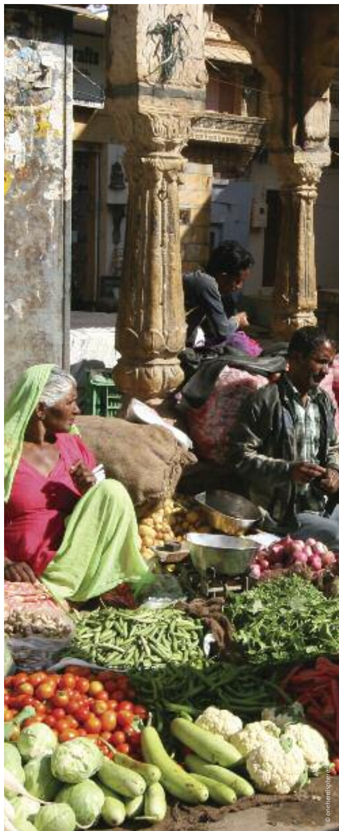
Selling local vegetables at a roadside market in Jaisalmer, Rajasthan, India.