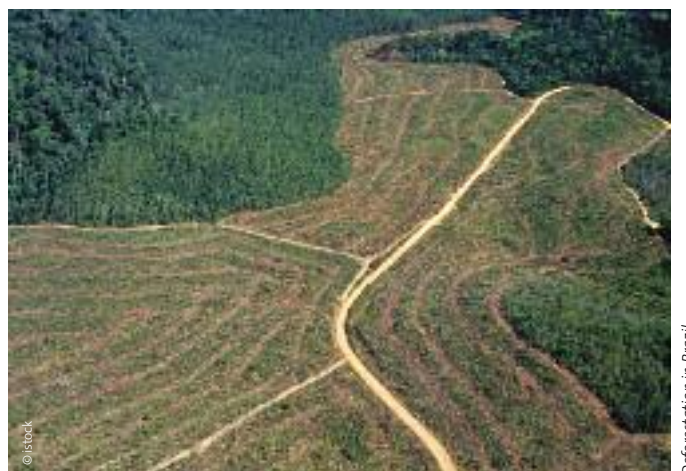
Deforestation in Brazil.

Some farmers in the US are also using paraquat and 2,4-D (a component of Agent Orange) on their soybean crops.