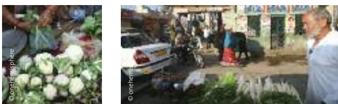
Left & Right: Market stands in Mandawa and Fatephur, Rajasthan, India.