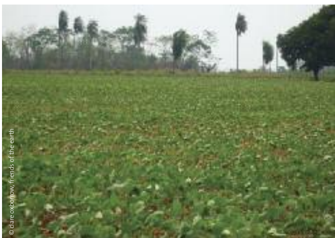
Soya fields that have just been sprayed in Paraguay.