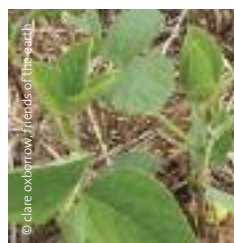
Close up of a Soya plant that has just been sprayed in Paraguay.