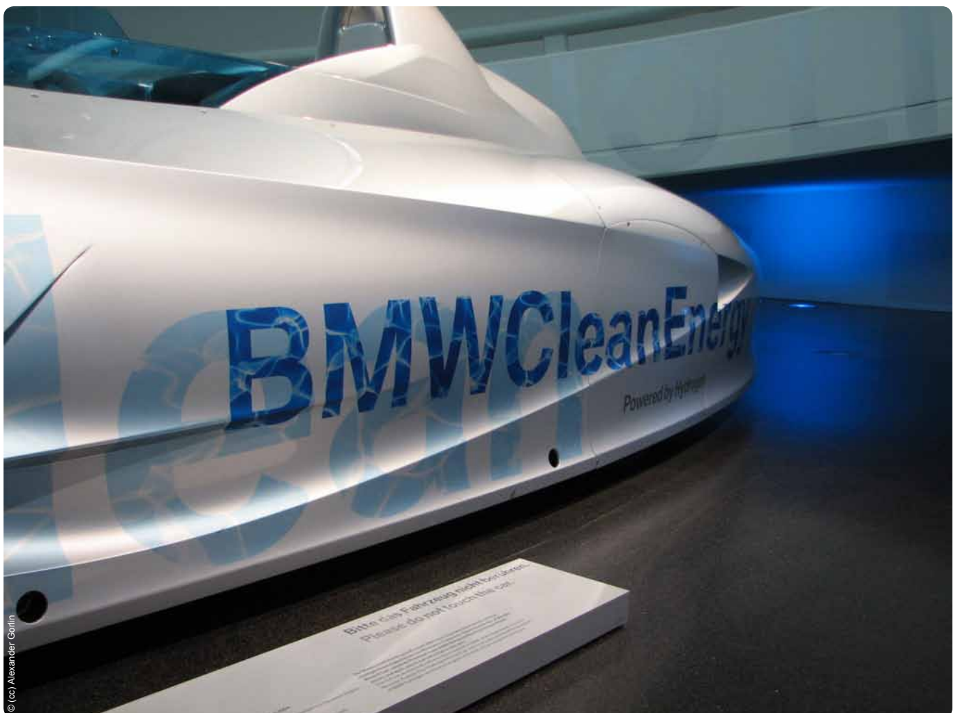
BMW showcasing hydrogen-powered concept car in the company museum in Munich, Germany.

In contrast to the strong representation of corporate voices, there is only one independent civil society representative among the Principals of the High Level Group – Sanjit Bunker Roy from the Barefoot College in India. Energy users, energy cooperatives, organizations representing people without energy access, small-scale energy cooperatives, environmental organizations, labour, communities affected by dirty energy extraction and processing, and Indigenous Peoples are not represented.